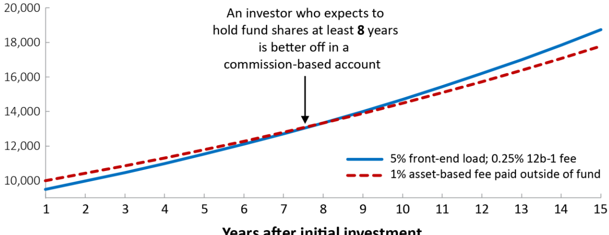
Years after initial investment