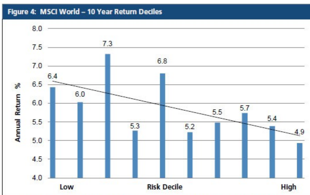
Composed of risk and return data for individual stocks segmented into risk deciles within the reference index

If a global mutual fund with a 3 year history augments its SD calculation with MSCI World index data, chances are it would be rated as Medium to High or High risk under the CSA proposal. But if the portfolio manager weighted the fund's portfolio with low volatility stocks, the actual returns might well be superior and with lower volatility. Thus, the proposed CSA rating system might deter a purchase by indicating a higher risk rating even though the fund's actual portfolio is less volatile than the index due to smart portfolio construction by the manager. Punishing astute managers doesn't feel right.